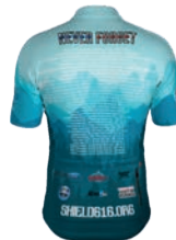
Jersey / Bib Sponsor: $5000