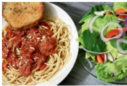
Food Sponsor: $1,500