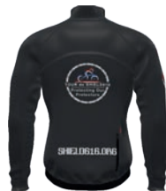
Cold Gear Sponsor: $2,500